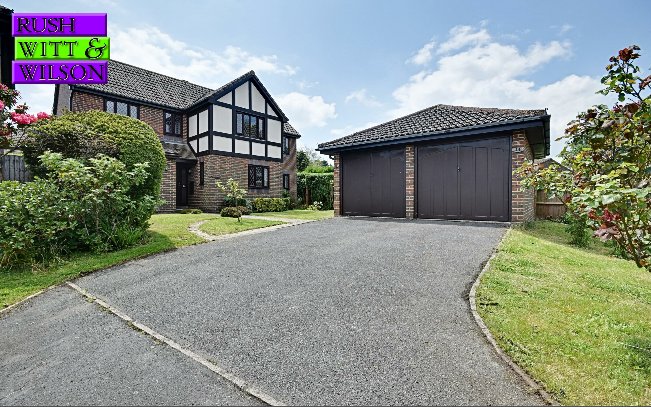
14 Constable Way, Bexhill-On-Sea, East Sussex TN40 2UH £485,000