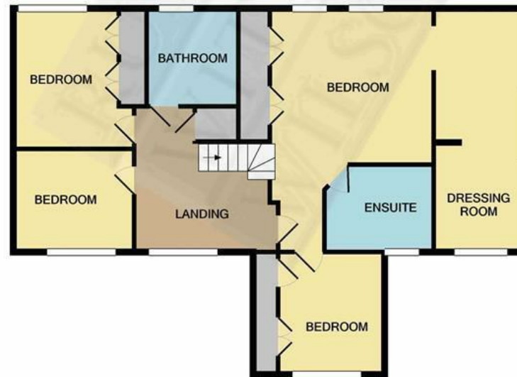
1ST FLOOR APPROX. FLOOR AREA 706 SQ.FT. (65.6 SQ.M.)

TOTAL APPROX. FLOOR AREA 1488 SQ.FT. (138.2 SQ.M.)